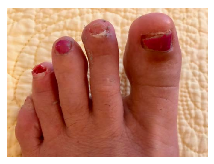
Ultrarunning Toes