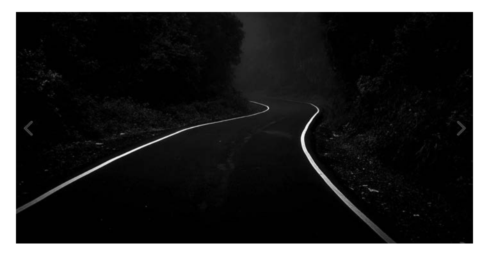
Road to A Life Full of Light