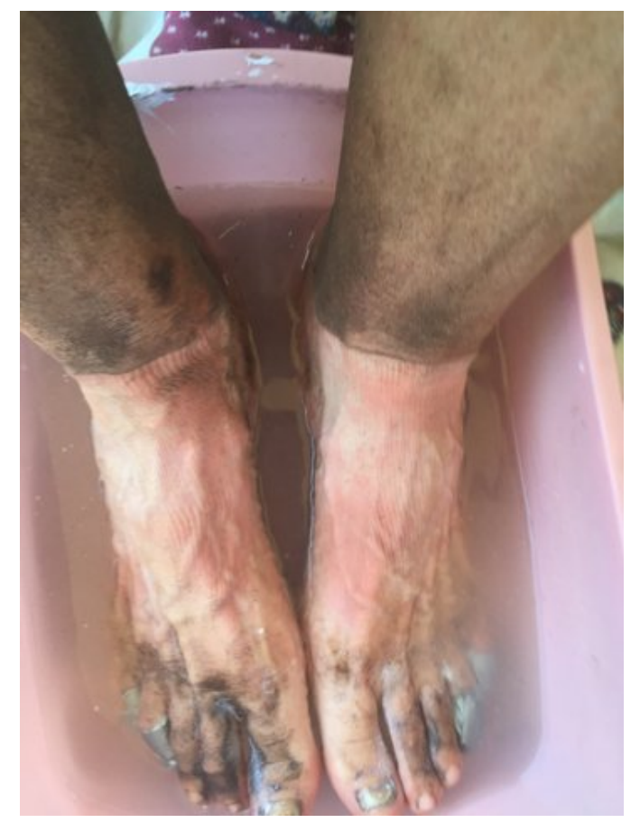
Feet Immersed in Ice Water; Toes Wrapped in Duct Tape © 2018 Miriam Diaz-Gilbert